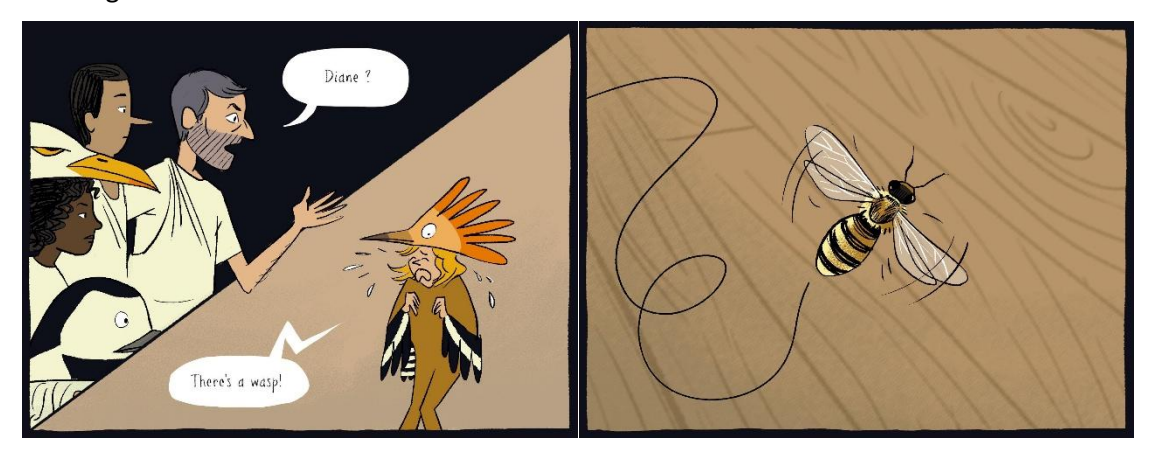
© Bergey & Govin, Stimuli Eds, 2024.

1. At the beginning of the story, Supertroupers meet the insect - some of them claim it is a wasp and others that it is a bee. What do you think? Justify your answer by the features shown on the drawing.