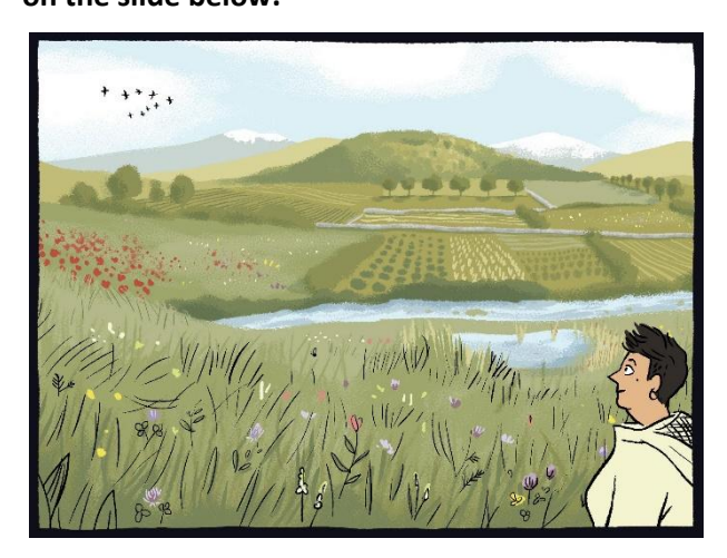
© Bergey & Govin, Stimuli Eds, 2024.

5. According to the beekeeper, the diversity of plant species is important for the bees. But this is only one dimension of biodiversity – species diversity. Analyze the second chapter of the BD and explain what are different levels of biodiversity. Mark those three different levels on the slide below.